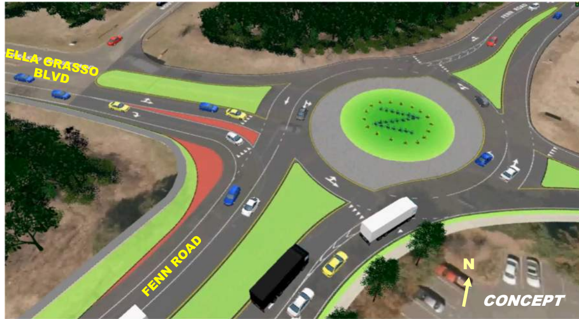
Roundabout at the Intersection of Fenn Road(SR505), Ella Grasso Boulevard(SR505) & Holly Drive