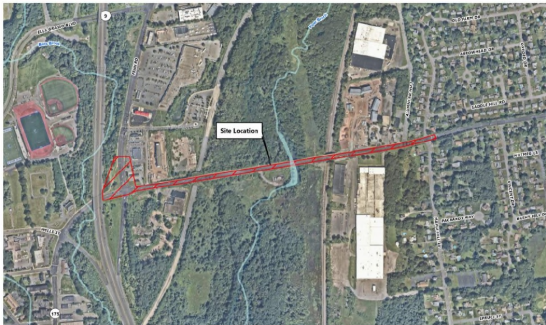
Figure 1: Aerial Location Map Route 175 Sidewalk | Newington, CT