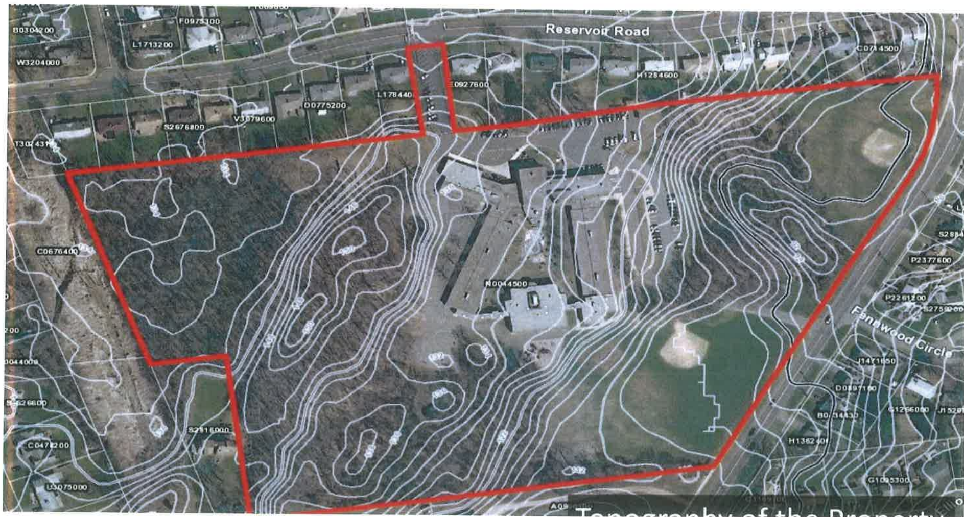
Topography of the Property